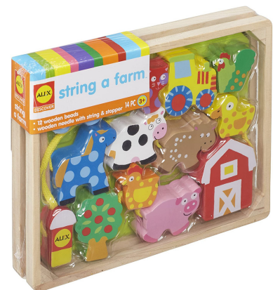
String a Farm