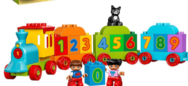
Lego Duplo Train